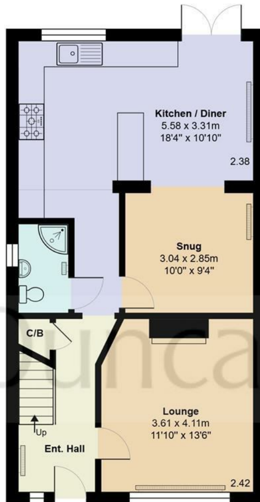
Ground Floor Area: 59.8 m 2 ... 644 ft 2